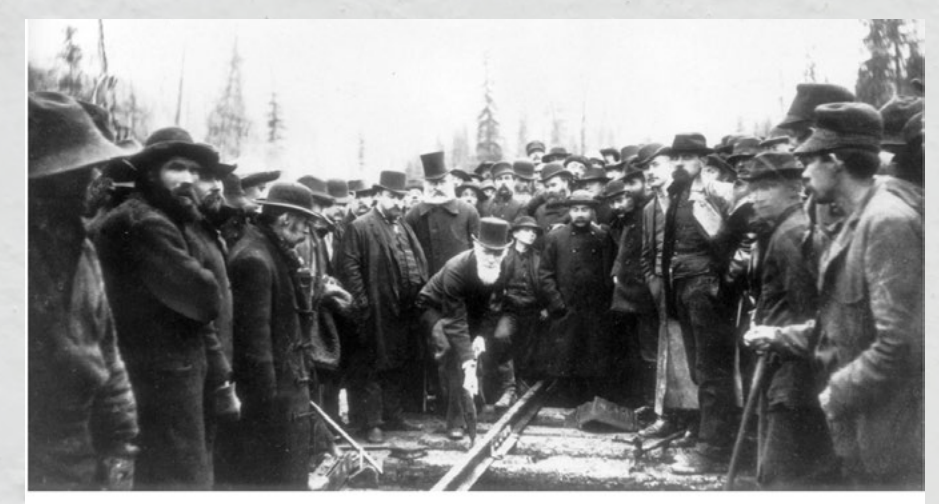
Corridors like the Canadian Pacific Railway (pictured), the Trans-Canada Highway and the St. Lawrence Seaway represent massive Canadian infrastructure accomplishments of past centuries.

Contest seeks 'transformational' projects to boost the Canadian economy